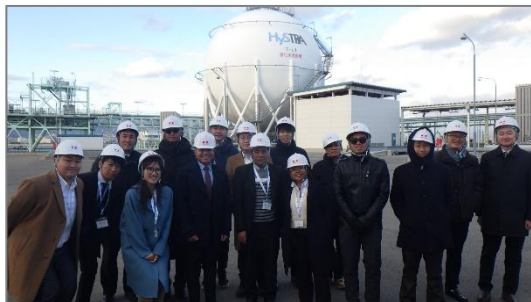
Kawasaki Heavy Industries Embarking on the liquefied hydrogen carrier