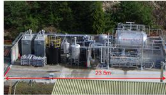
Large-scale ammonia supply system