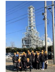
Mitsubishi Heavy Industries Tour the hydrogen production, storage, and utilization chain at Hydrogen Park