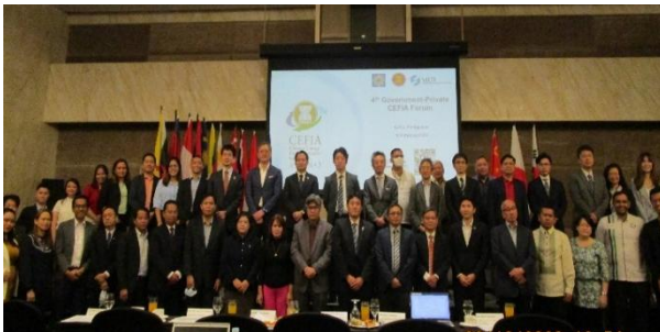
4th CEFIA Forum February 16, 2023 Cebu, Philippines