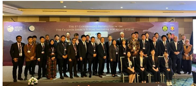
5th CEFIA Forum August 25, 2023 Bali, Indonesia