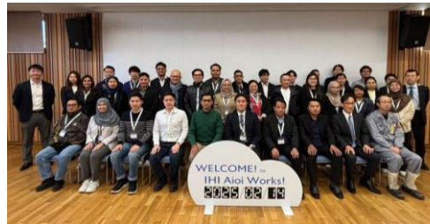
IHI Tour Ammonia-Fueled Gas Turbine Test Site