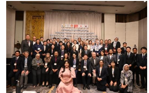
6th CEFIA Forum July 23, 2024 Bangkok, Thailand