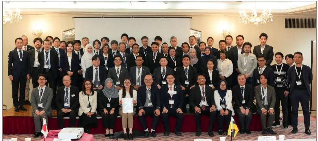
Group photo after the forum